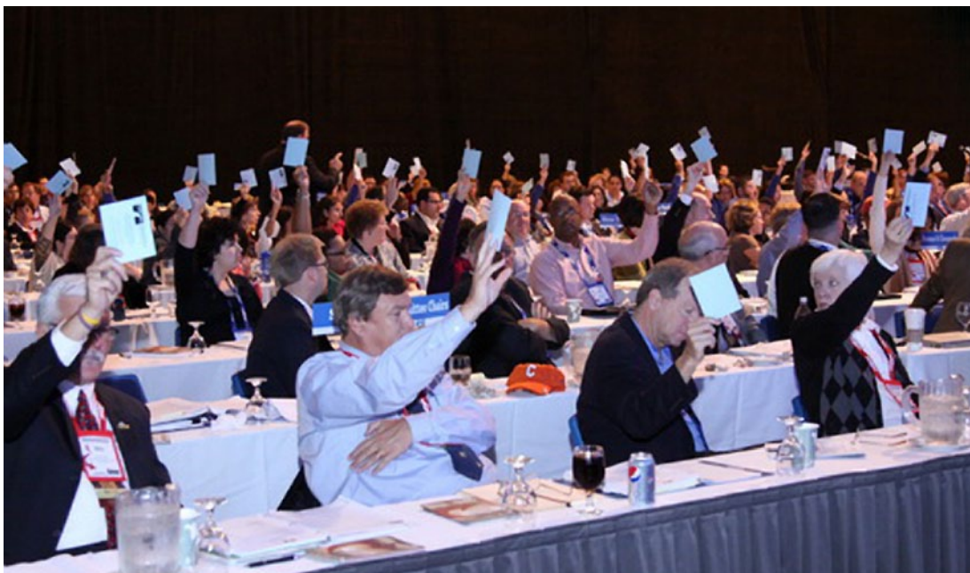
PCACAC Delegates join representatives from around the country to conduct business during the NACAC Assembly.