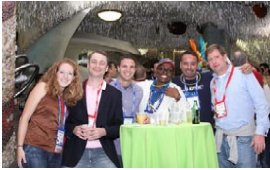
Conference participants socialize and network during NACAC's 66th National Conference.

(200 Assembly members and 14 NACAC Board of Director members). As was mentioned in previous communication in The Anchor and through e-blasts, PCACAC's delegation to future NACAC conferences will go from 18 delegates to 14 delegates. The good news from our standpoint is that we have 4 delegates coming to the end of their terms, so no new delegates had to lose that seat in the Assembly. Along with some clarification and slight language change within the Statement of Principles of Good Practice, it was a relatively smooth Assembly and General Membership Meeting. The budget will continue to be a concern for NACAC, as well as PCACAC and individual institutions. There will always be the questions, "What do we need to do?, What can we afford to do?, and What would we like to do?" as an organization. How do we best serve our members and the students that